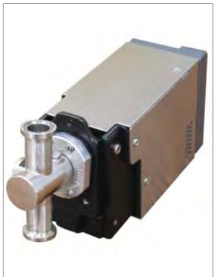
VMP Electronic Variable Displacement Pump