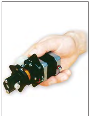
STH Compact OEM Pump