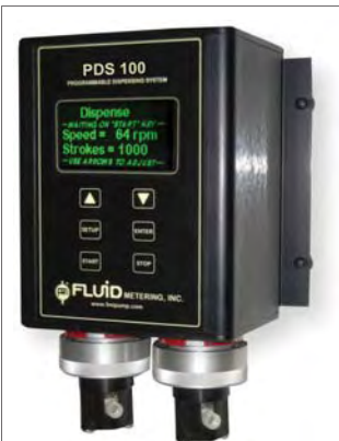
PDS-100 Programmable Dispensing System