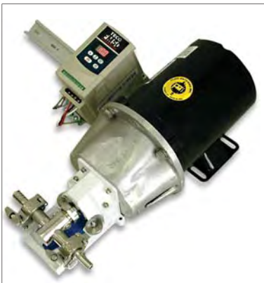
IVSP Industrial Variable Speed Pump